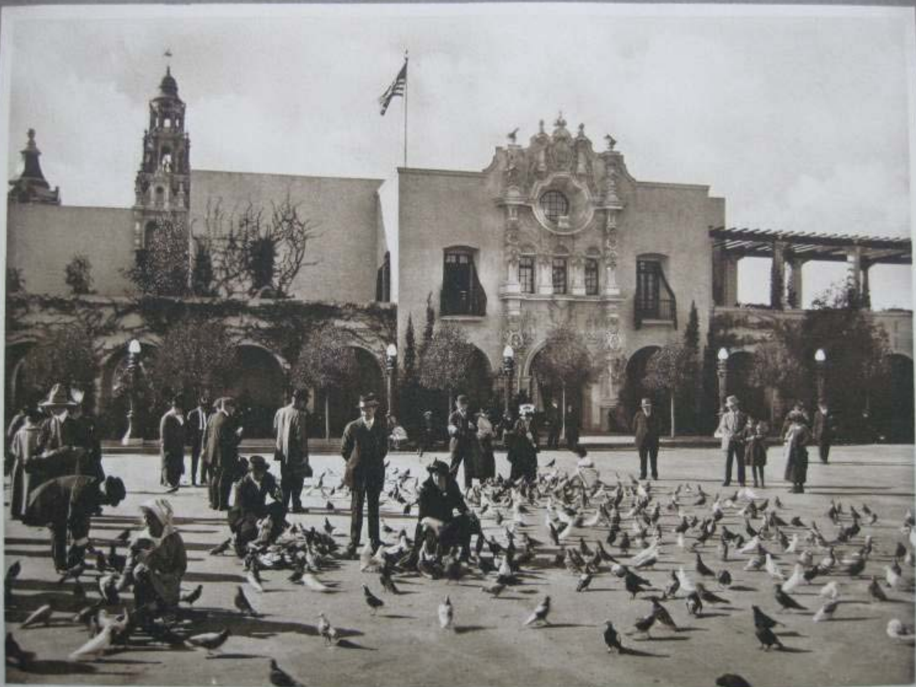
THE PIGEONS ON PLAZA DE PANAMA