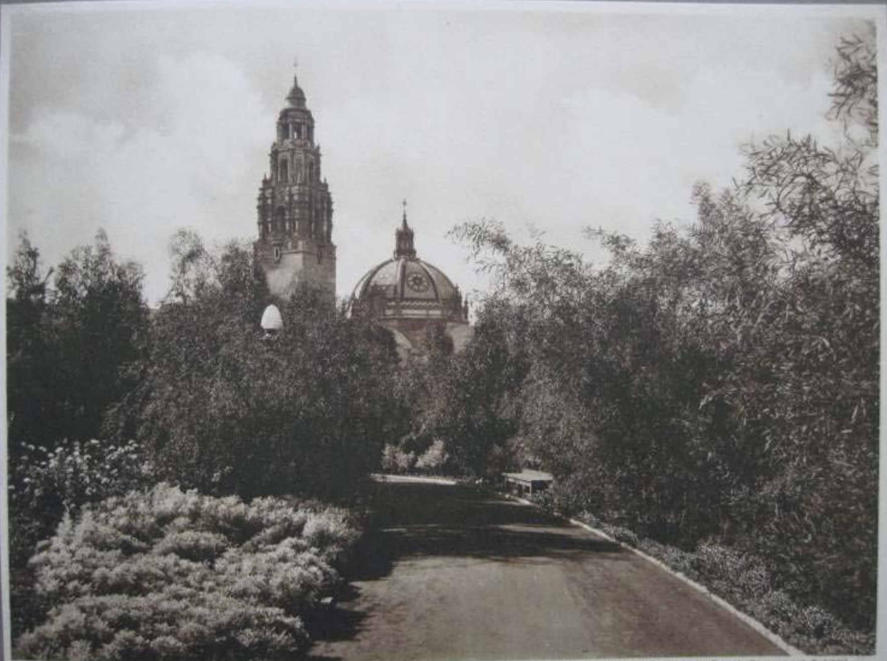
CALIFORNIA STATE BUILDING, (Containing Fresh Government Exhibit)