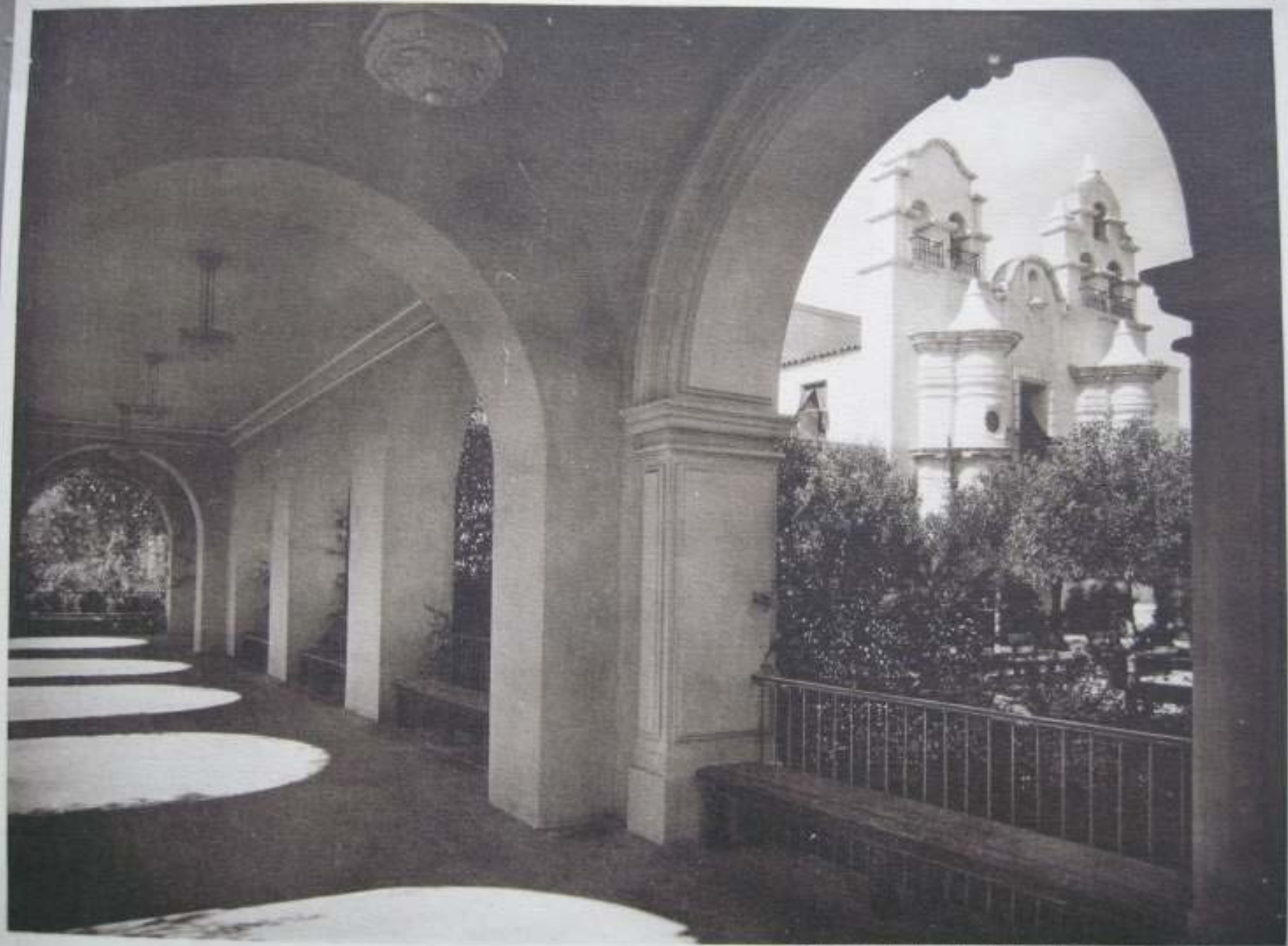
TOWER OF RUSSIA AND BRAZIL BUILDING THROUGH ARCH.