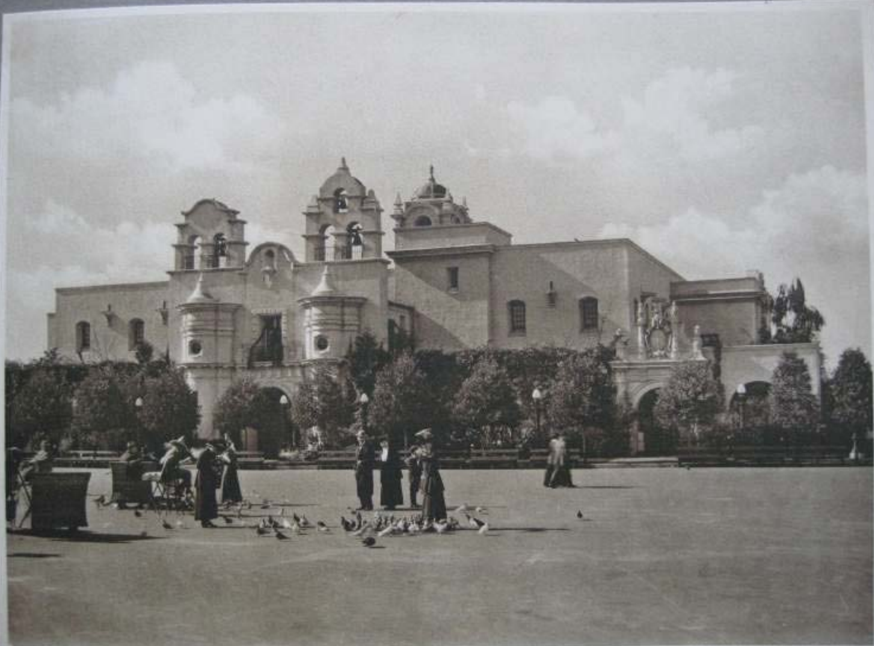
RUSSIA AND BRAZIL BUILDING.