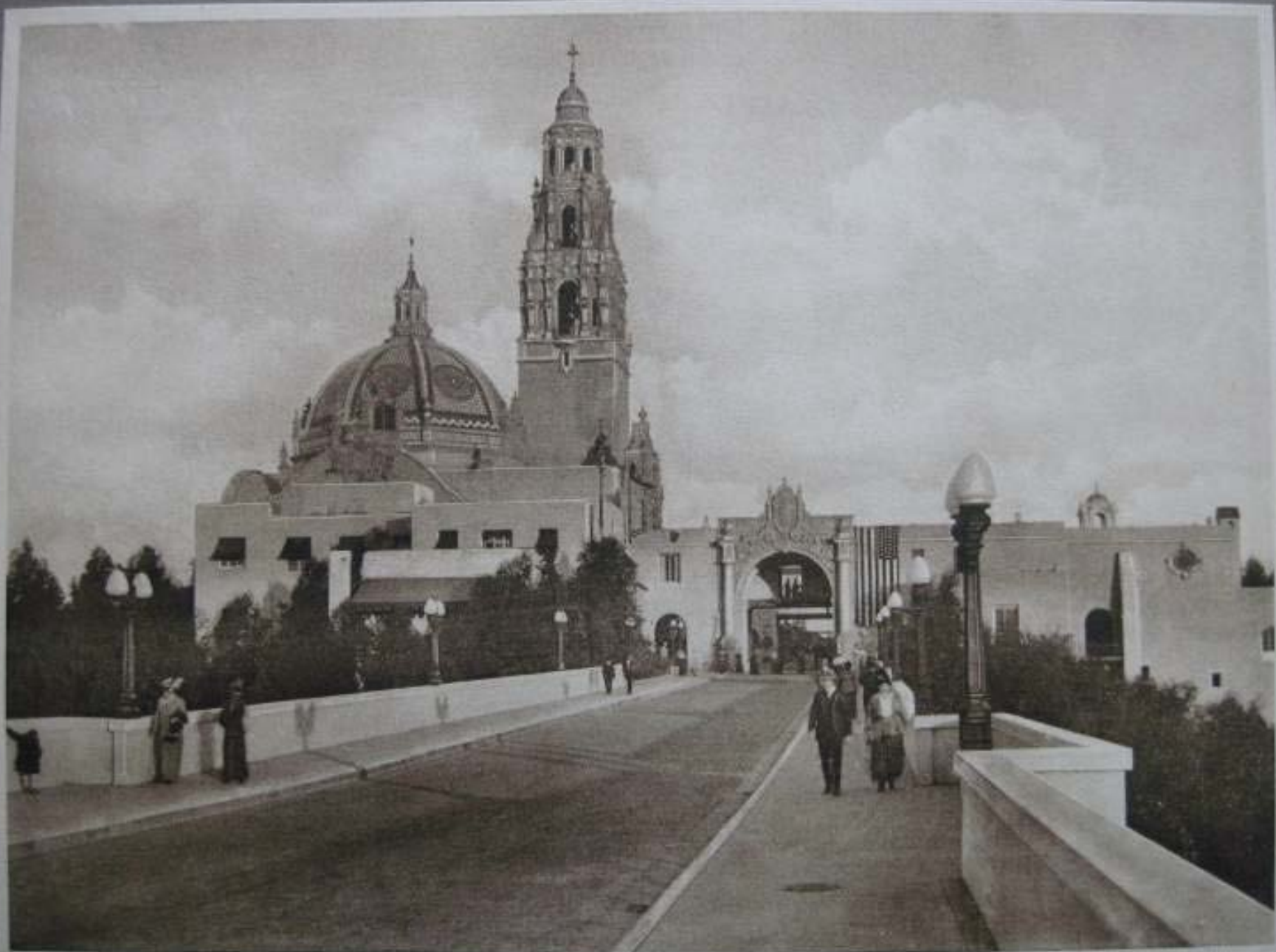
CALIFORNIA BUILDING. ENTRANCE TO PLAZA DE CALIFORNIA.