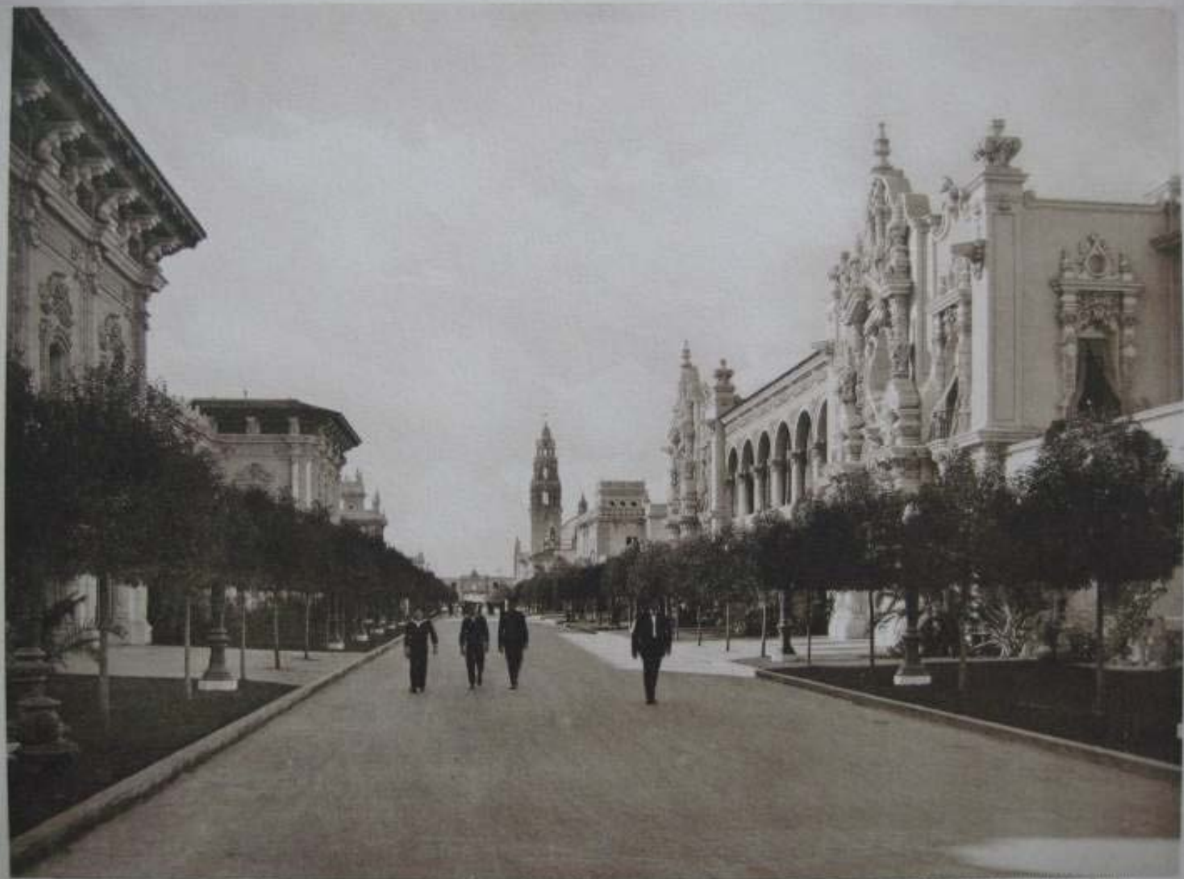
Canadian Government Building