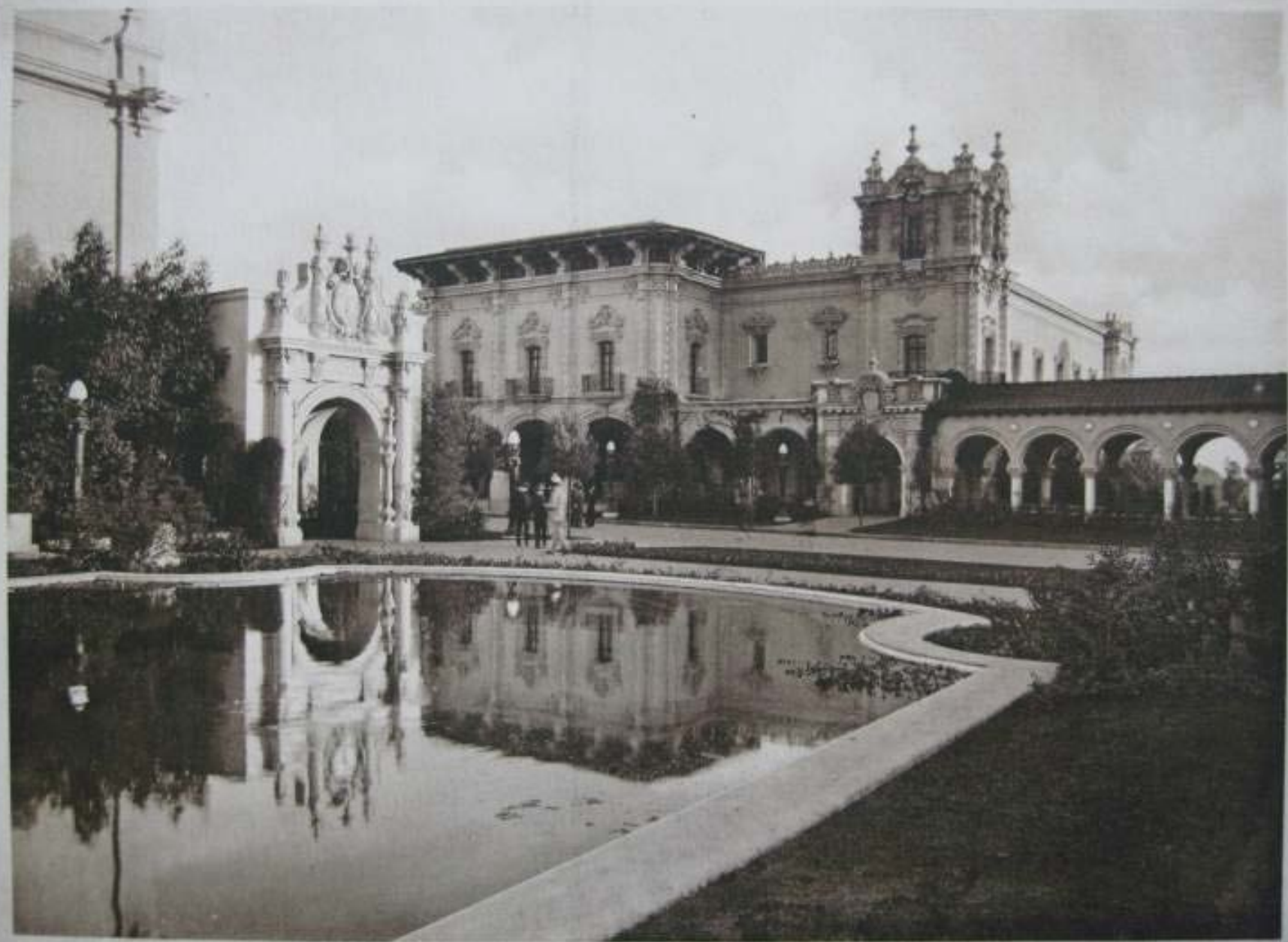
CANADIAN GOVERNMENT BUILDING, FROM LA LAGUNA DE LAS FLORES.