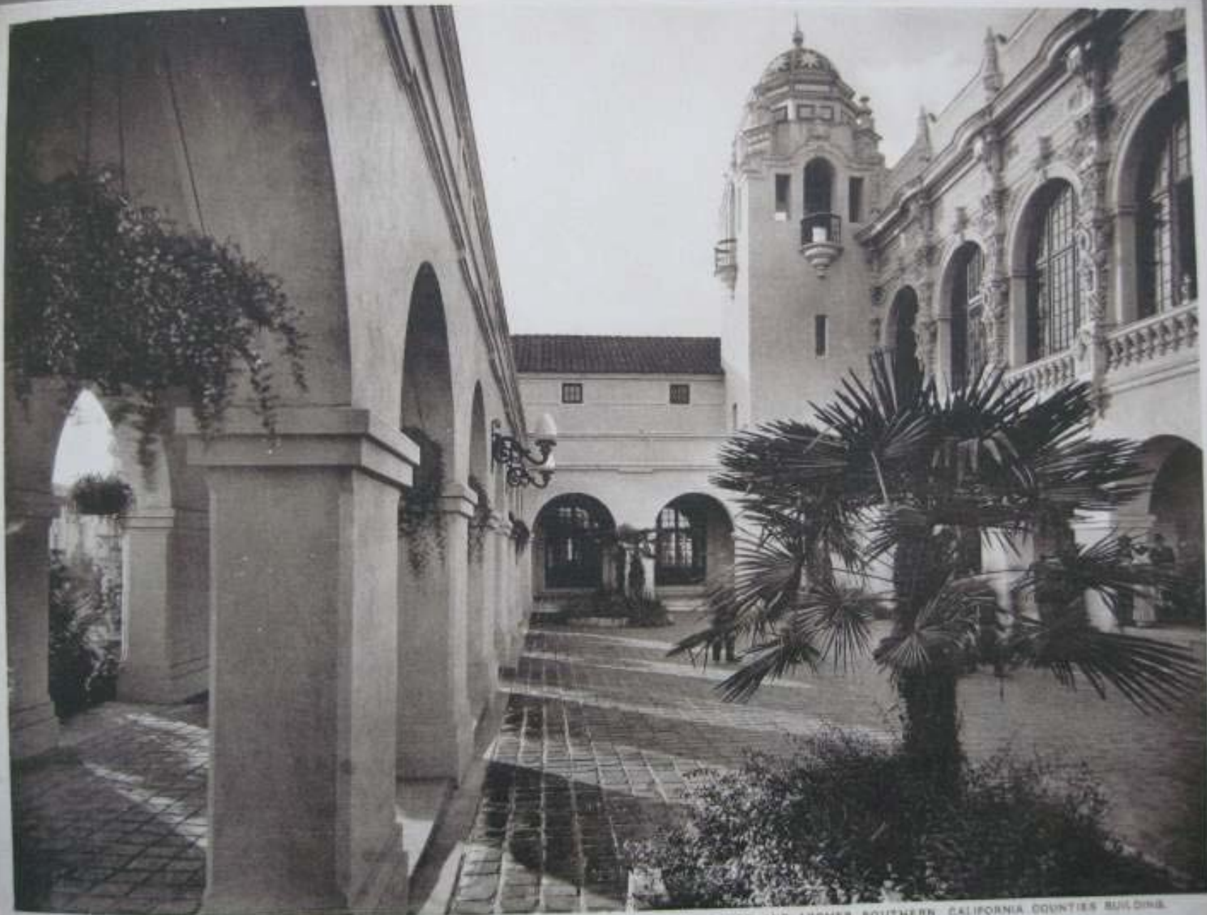
THE COURT AND ARCHES, SOUTHERN CALIFORNIA COUNTIES BUILDING.