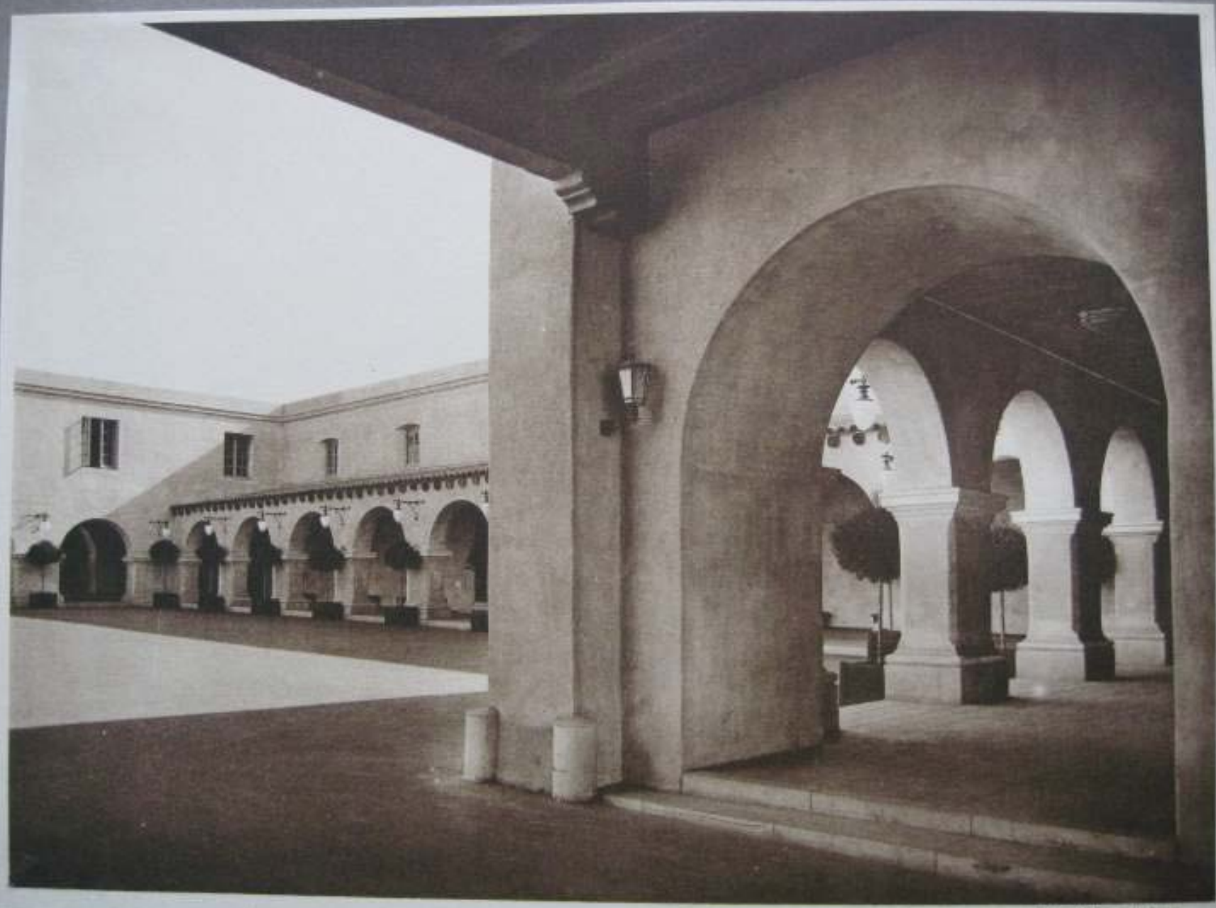
FINE ARTS BUILDING