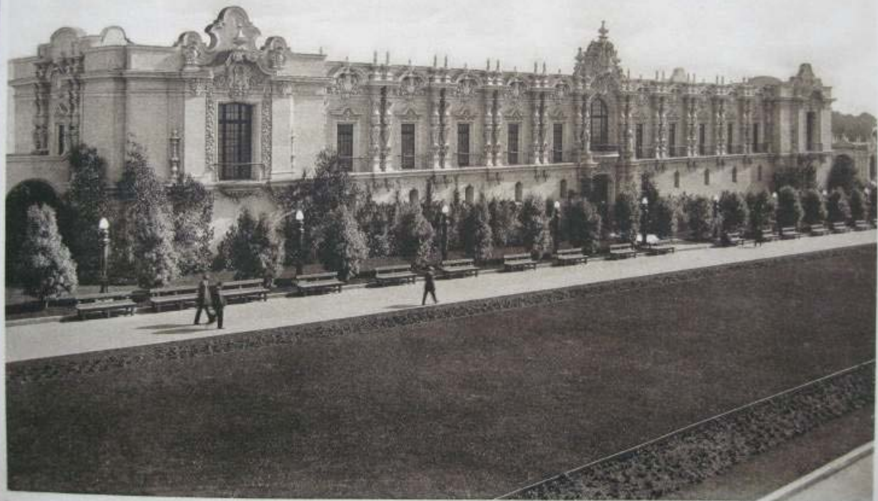
SAN JOAQUIN VALLEY BUILDING.