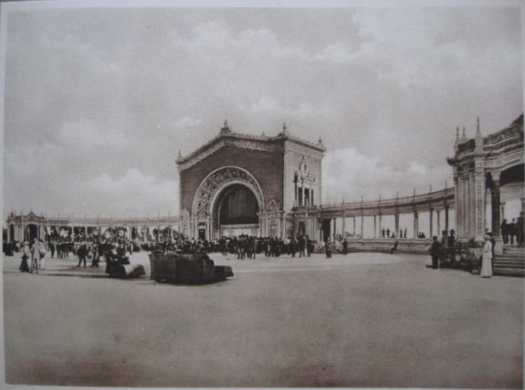
THE GREAT OPEN AIR ORGAN AND PAVILION.