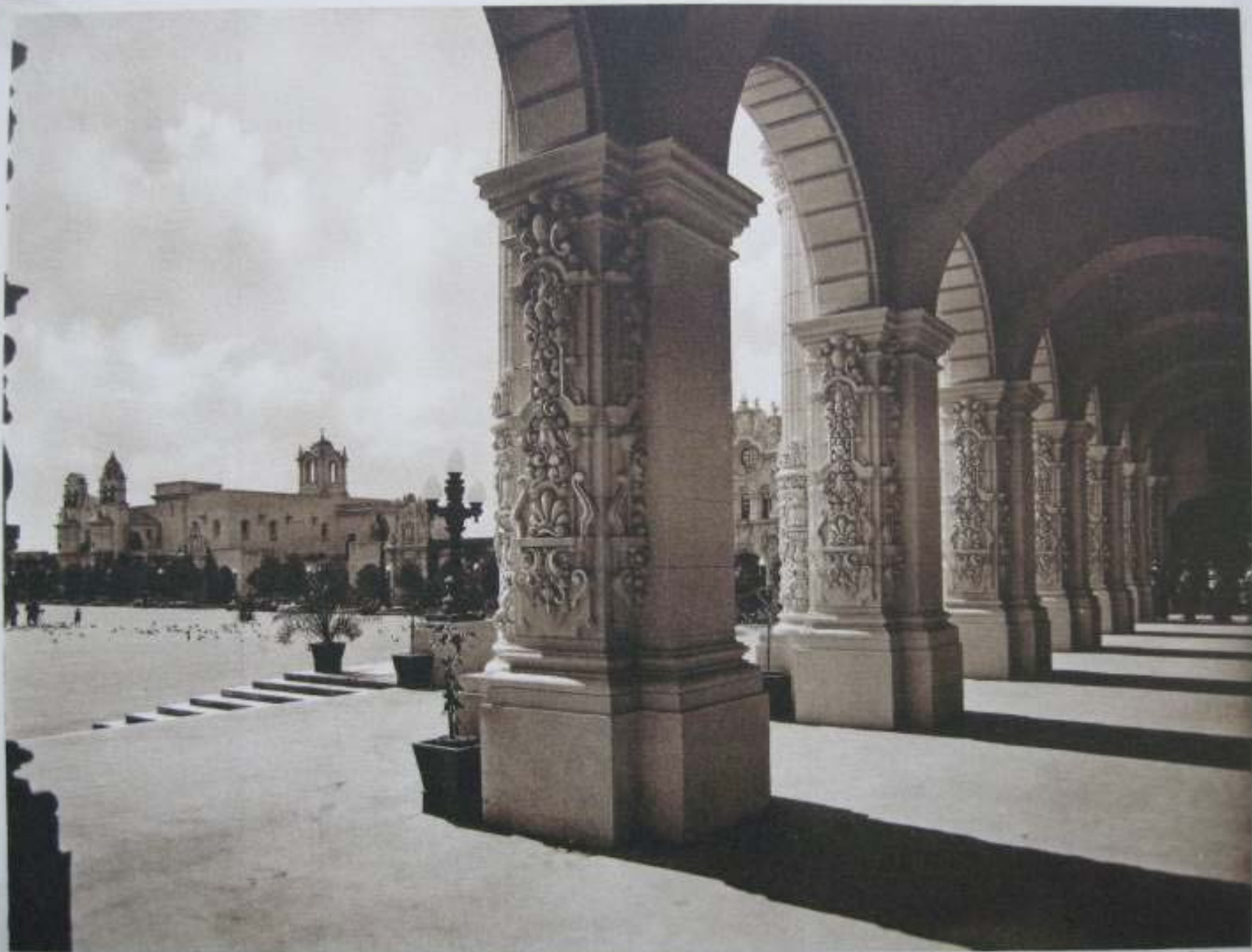
COLONNADE OF THE UNITED STATES GOVERNMENT BUILDING.