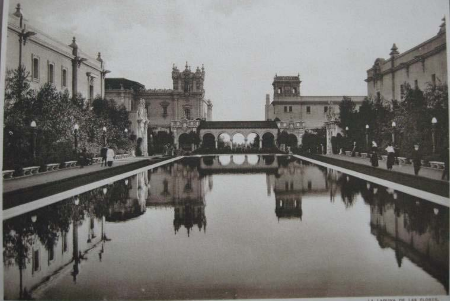
LA LAGUNA DE LAS FLORES.