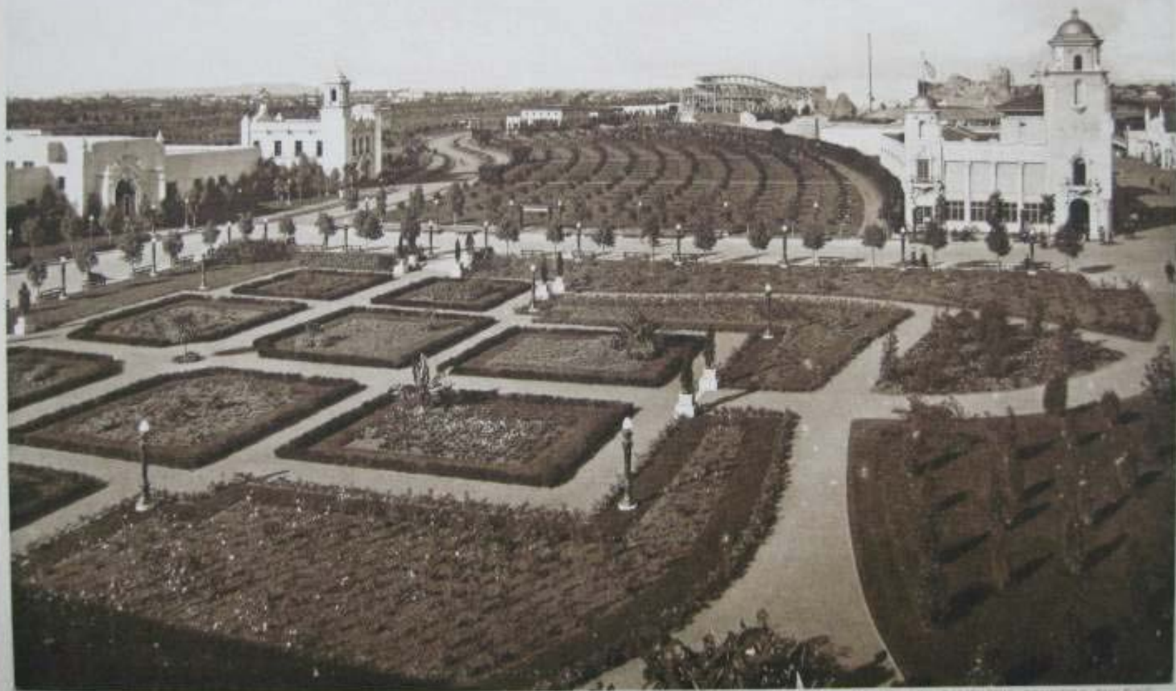
FORMAL GARDENS AND ORANGE GROVE, FROM SOUTHERN CALIFORNIA COUNTY BUILDING.