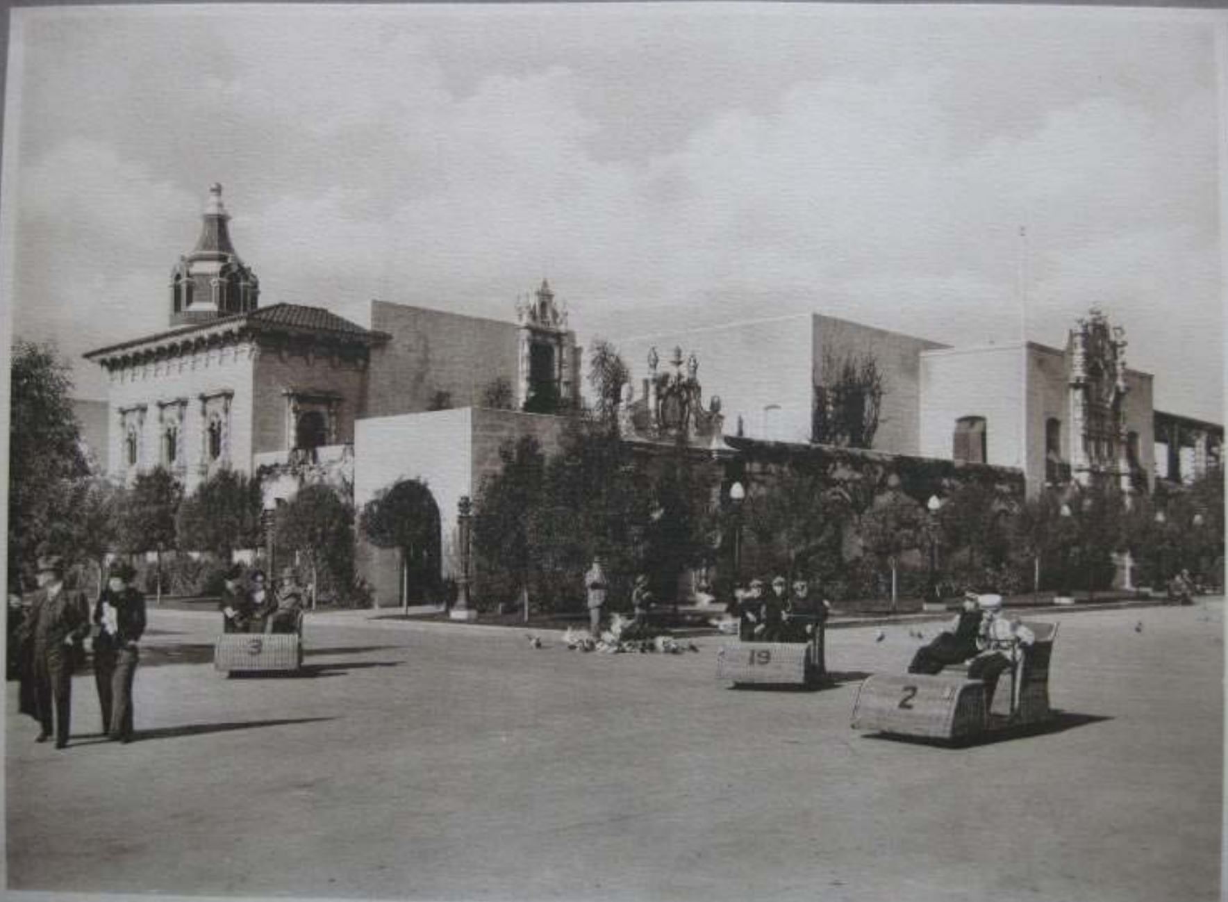
SCIENCE AND EDUCATION BUILDING.