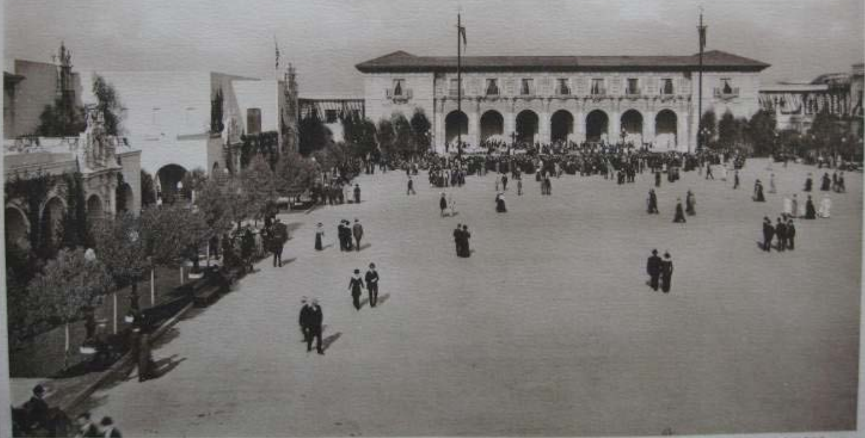
UNITED STATES GOVERNMENT BUILDING.