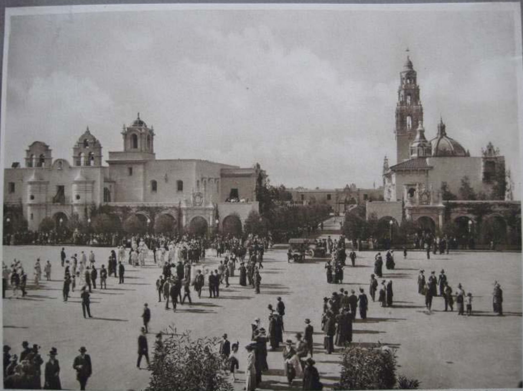
EL PRADO AND PLAZA DE PANAMA.