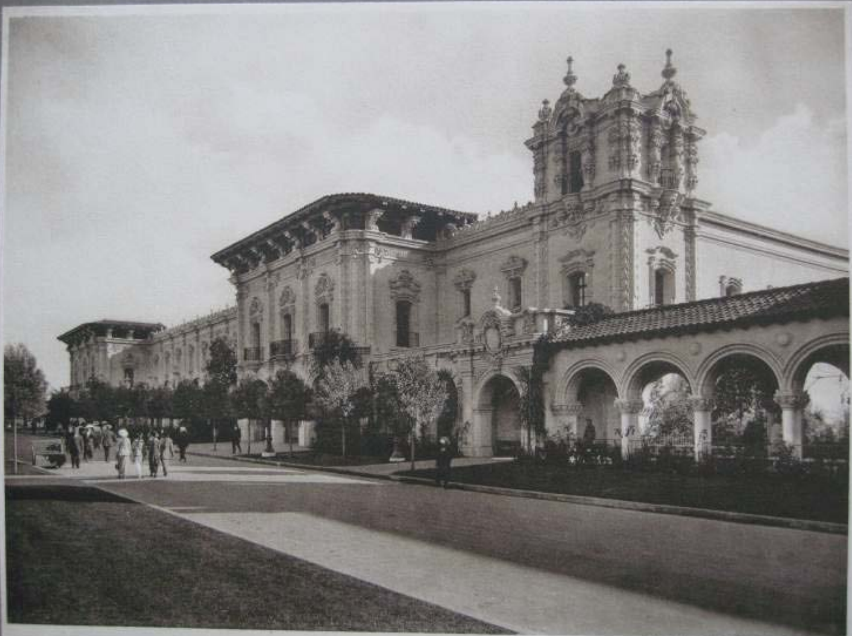
CANADIAN GOVERNMENT BUILDING.