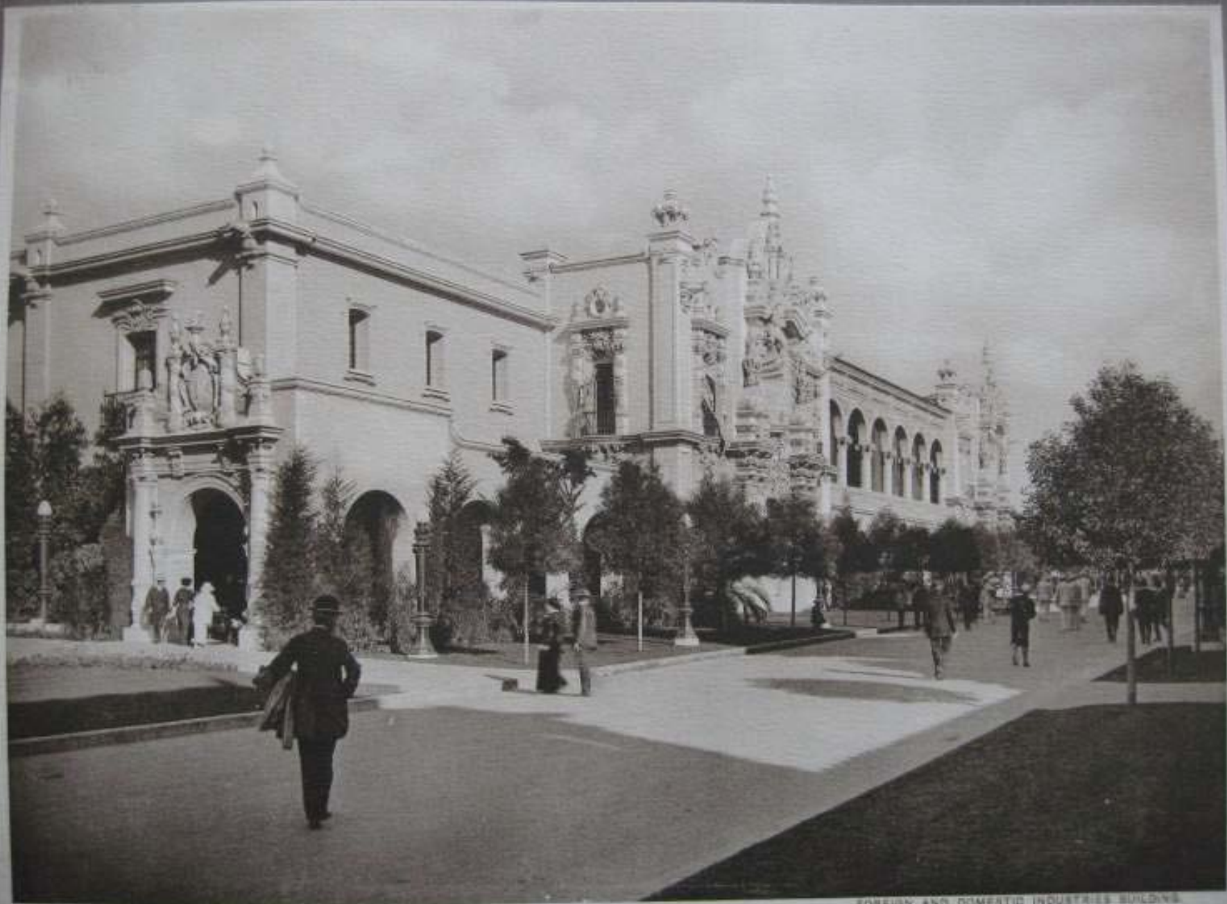
FOREIGN AND DOMESTIC INDUSTRIES BUILDING