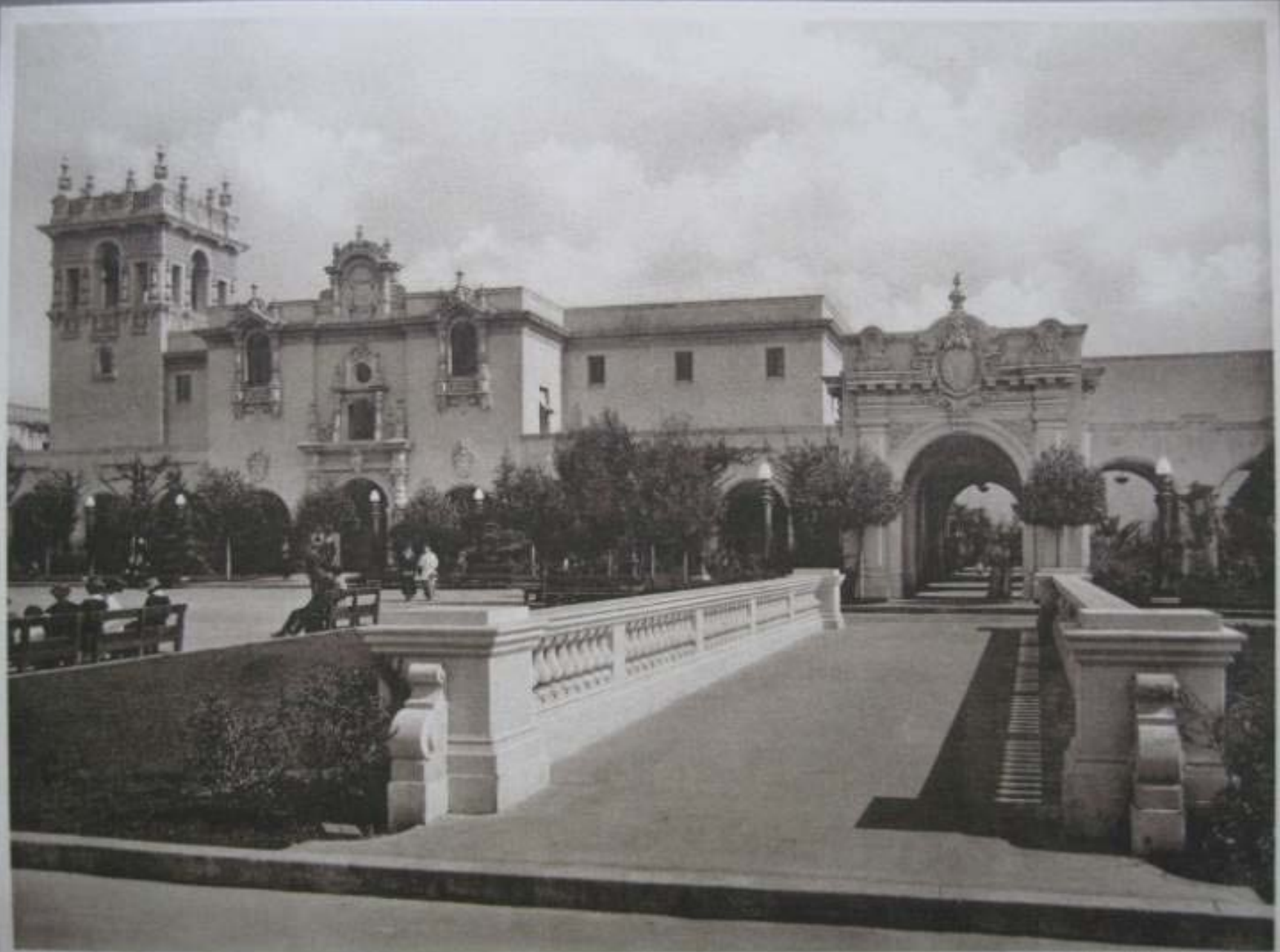
FOREIGN ARTS BUILDING