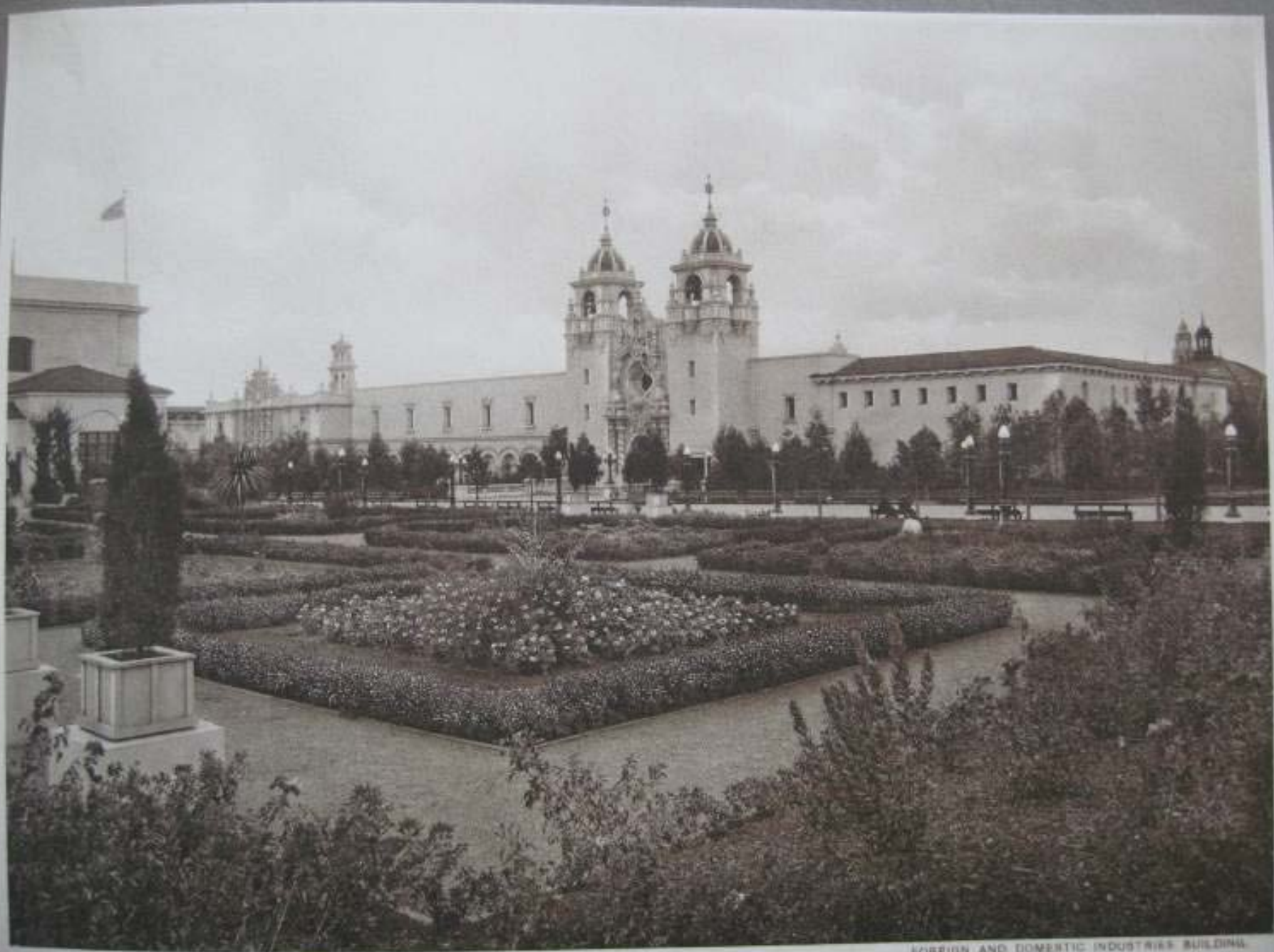
FOREIGN AND DOMESTIC INDUSTRIES BUILDING